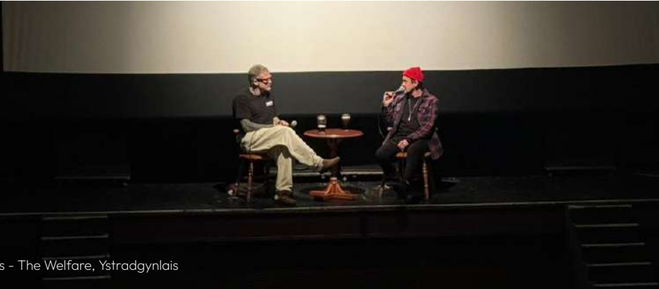
Image: The Road of Excess - The Welfare, Ystradgynlais

They noted that for some attendees of their Mother & Baby screenings, this was their first trip back to cinema in two years. The Road of Excess was also popular with new attendees and has resulted in a new collaboration around men's mental health.