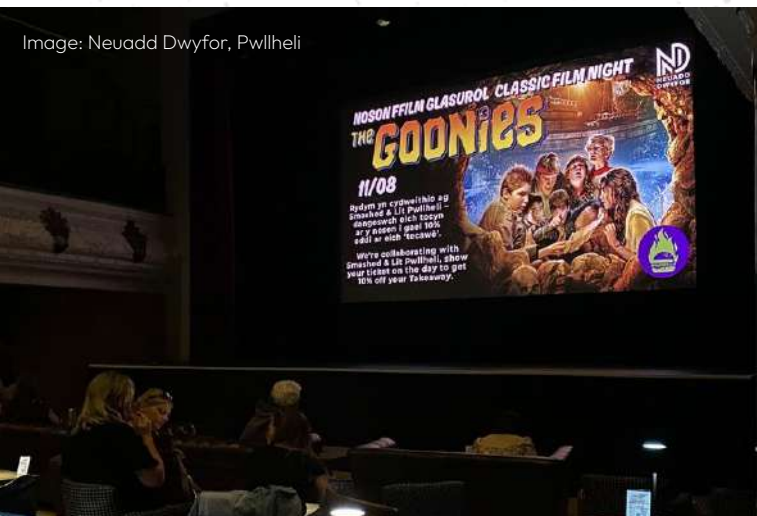
Image: Neuadd Dwyfor, Pwllheli