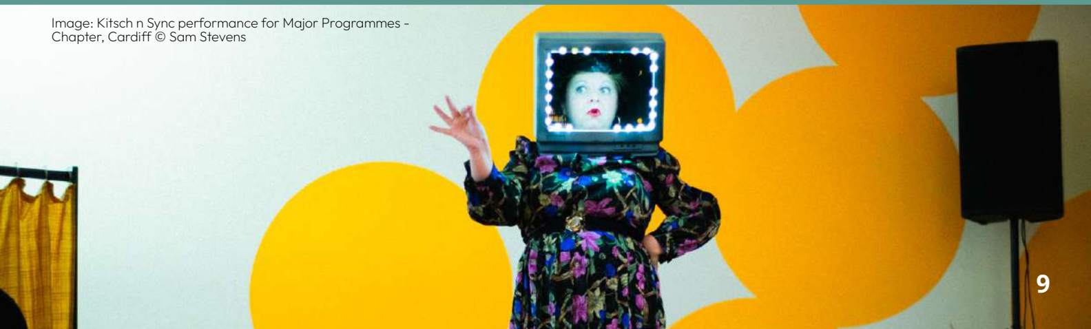
Image: Kitsch n Sync performance for Major Programmes - Chapter, Cardiff

We supported four partners to deliver Melodrama projects, including Sheba Soul, Torch Theatr and Darkened Rooms who had a special sold out Brief Encounter event at Insole Court. Chapter Arts Centre delivered an impressive 57 screenings, including films along the theme of 'hiraeth' meaning a longing for a past that exists in your imagination. Ticket sales showed that 18% of the audience for Hiraeth was under 30, supported by the new Chapter Clwb scheme. They screened the premier of Welsh language film Tanau'r Lloer (Fires of the Moon) with a bilingual Q&A, which was popular, as well as structured discussions around themes of racial identity for films such as Proud Valley, LGBTQ+ themes for films such as Polyester and Women's pictures around Now, Voyager and Stella Dallas.