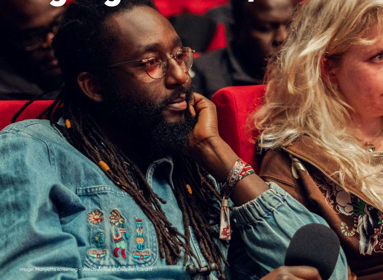
Image: Manyatta screening - Watch-Africa at Chapter, Cardiff

From Cardiff Animation Festival's Wales-wide tour of an animated Welsh language classic, to the Magic Lantern bringing home the first BIFA Cinema of the Year award, 2025 has been packed full of big screen activities! You've been busy working on affordable and accessible events that brought the best UK independent and international film to local communities.