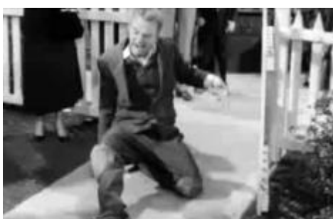
Pevney)- miracle cure